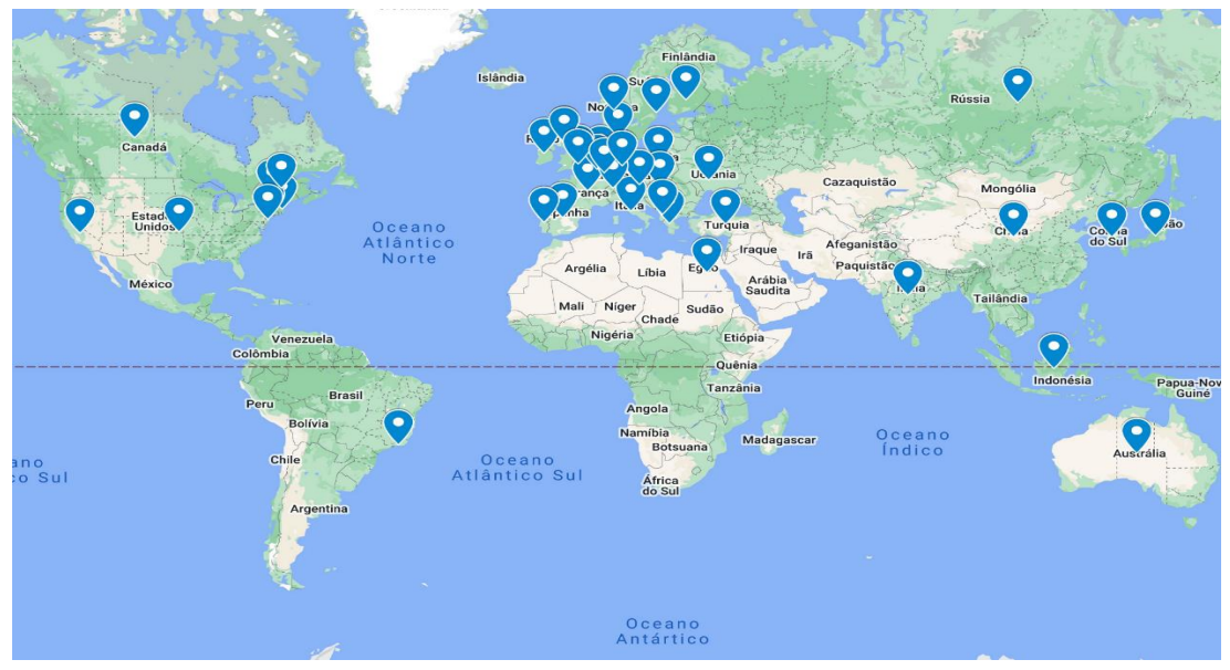
Figure 2 Geographical location of all contributing organizations